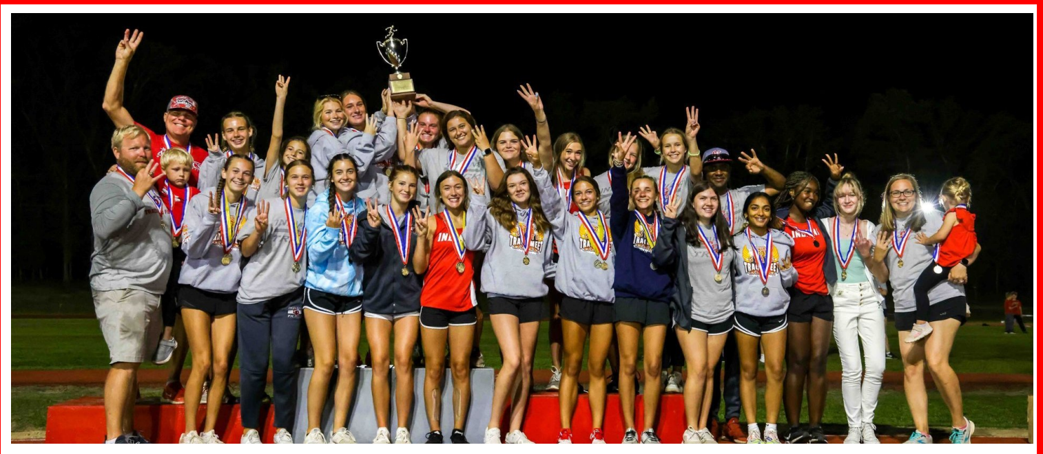
The Orangeburg Preparatory School girls track and field team won its third consecutive SCISA state championship at the OP athletic facility on Friday, May 5, 2023.