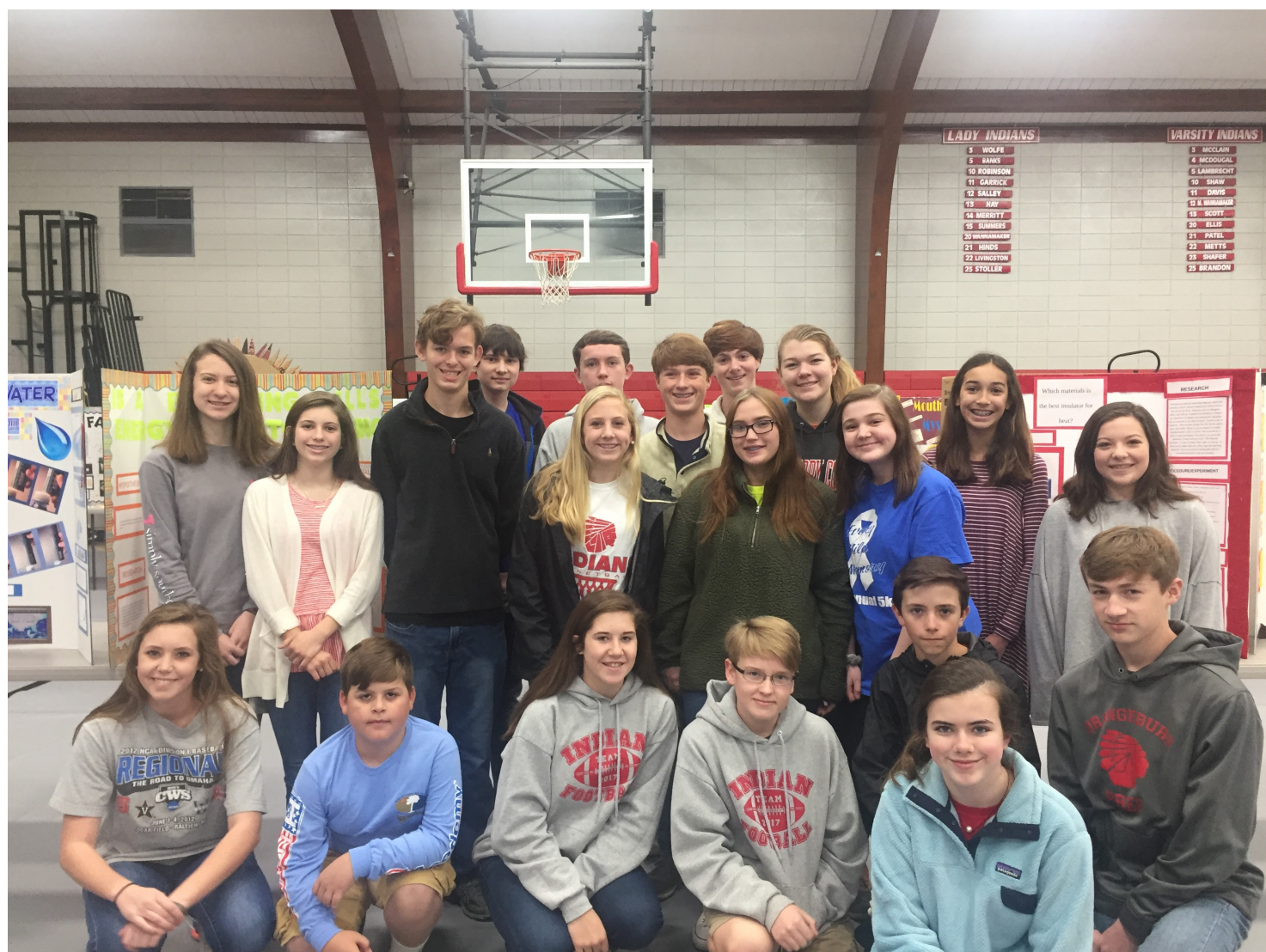
Pictured above are some of the OPS Science Fair winners. A complete listing of names is on the next page.