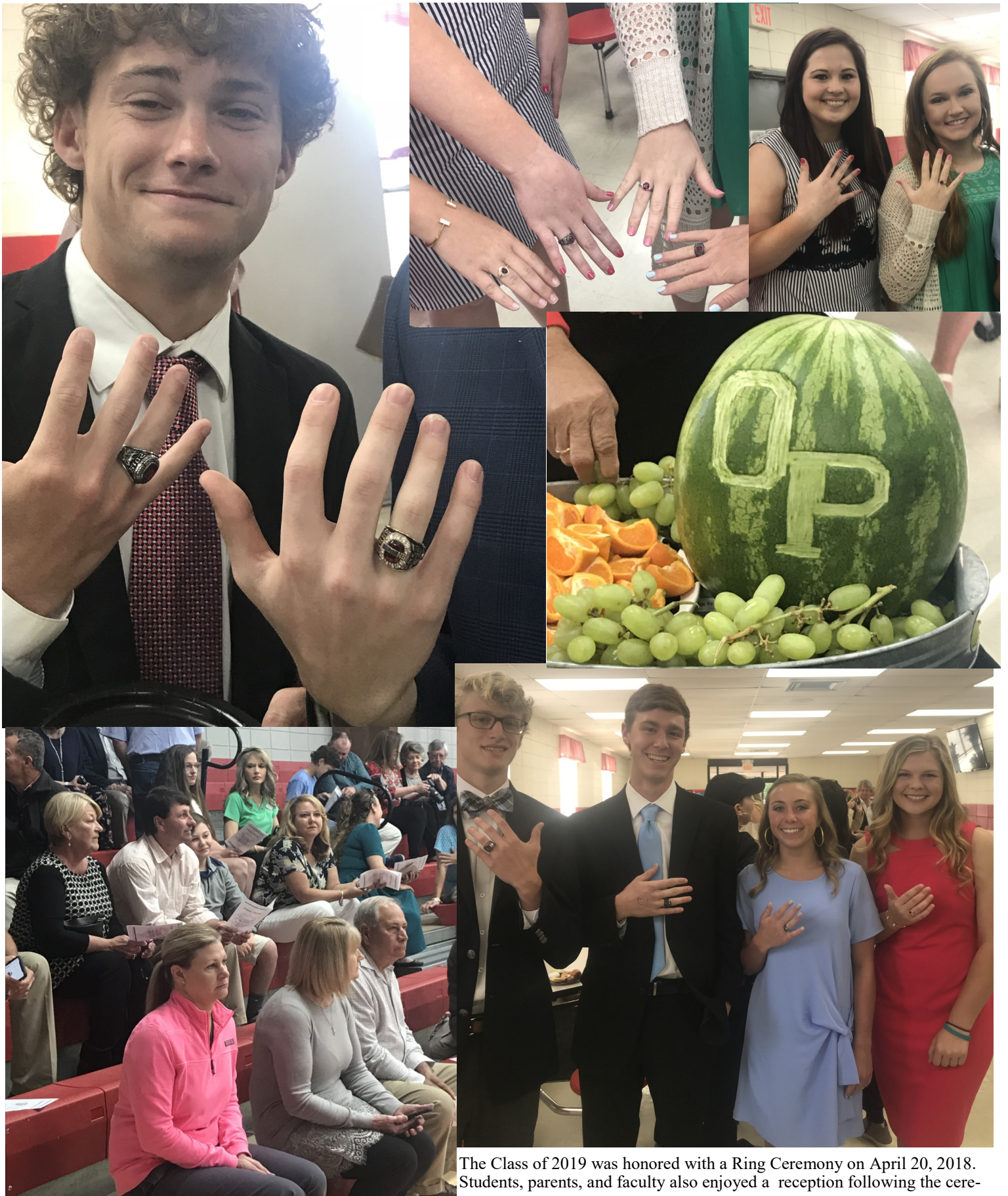
The Class of 2019 was honored with a Ring Ceremony on April 20, 2018. Students, parents, and faculty also enjoyed a reception following the ceremony.