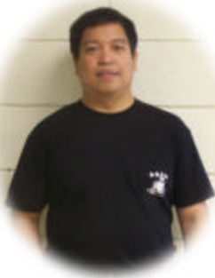
Full article may be found: GSESC to participate in FIRST LEGO League By PHIL SARATA, T&D Staff Writer/Saturday, July 25, 2009

Finding ways to earn Bonus Box Tops are easy! Be sure to check boxtops4education.com to learn about these opportunities!