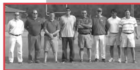
WA 1986 State Champion Baseball Reunion