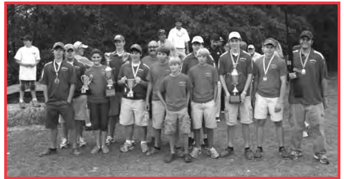
SCISA State Championship Sporting Clays Team