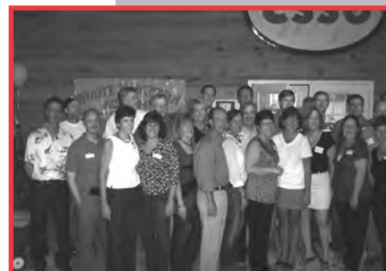
WHA Class of 1980 Reunion